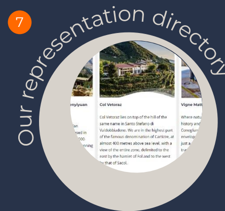
Wineries looking for distribution , shared with targeted UK buyers