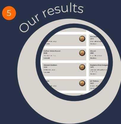
The results section of the IWSC website