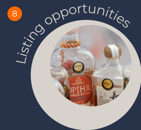
With Spirits Kiosk (UK) for Gold & Trophy Spirit winners