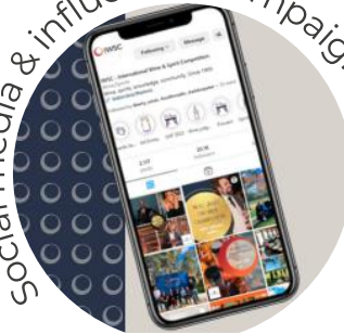
Social media & influencer campaign